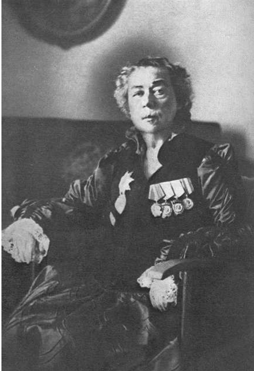
Alexandra Kollontai, 1872-1952

“The working woman is first and foremost a member of the working class.”